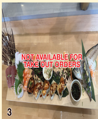
Sushi and Sashimi Platter .....$85.00 (Serves 2-3) 1 Kind Chef Choice of Seasonal Fish, 12pc Sashimi, 9pc Nigiri, 1 Chef Roll