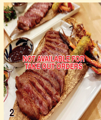
Japanese Wagyu A5 Steak Dinner Served With Soup, Salad and Rice.....4oz $99.00