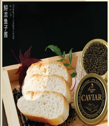
*Black Caviar with Bread ..... $98.00