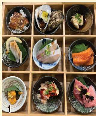
*Omakase Dream Box 6 COURSE MEAL Our Popular Signature Box with Raw and Cooked Bites in Wood Box for 1 person... Soup, Box, Chawanmushi, Spc Nigiri, Tpc Hand Roll, Dessert .....$85.00