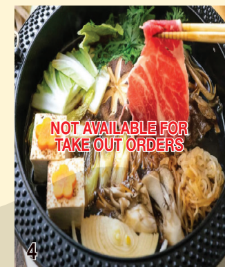
A5 Wagyu Sukiyaki .....$39.95 Japanese Miyazaki A5 Wagyu Beef, Onion, Mushroom, with Egg