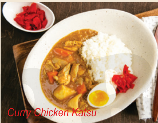
Curry Chicken Katsu

House Made Cha Shu Bun ..... $5.25/pc Sweet pork with sweet bun