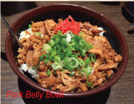
Pork Belly Bowl

Japanese Chicken Katsu ..... $16.95 with Japanese Curry Sauce