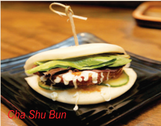
Cha Shu Bun

Ramen ..... $13.50 Tonkatsu / Spicy Miso / Shoyu